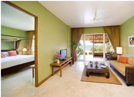
Tropical Suite Room

Centara Chaan Talay Resort & Villas Trat is backing onto a river with tropical gardens to one side and an 800-metre stretch of sugar-white sand dotted with casuarinas trees. A large infinity pool is set on the beachfront. The resort offer complimentary equipment for non-motorized water sports such as snorkeling and kayaking. Aromatherapy, therapeutic massages and skincare treatments are provided in the restful ambience of the resort spa. For participants who prefer to stay connected, wireless internet access is available throughout the resort with compliments.