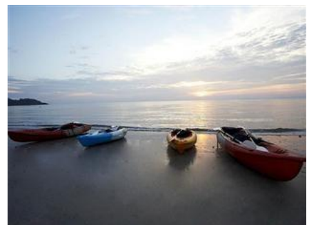
Non-motorized water sports activity