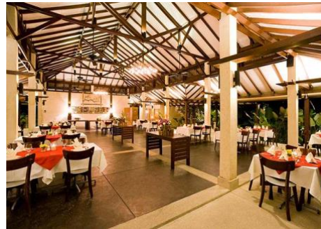
Azure, beachside restaurant for breakfast