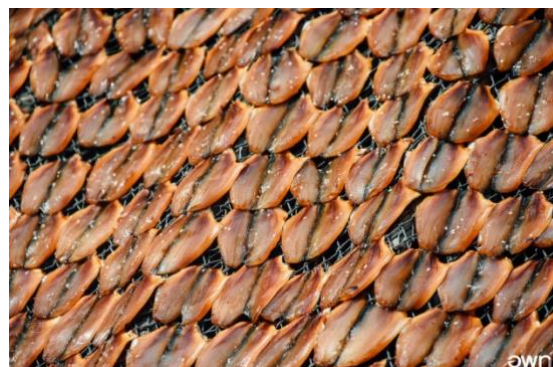
Trat's Khlong Yai district fishing village