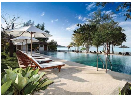
Infinity swimming pool